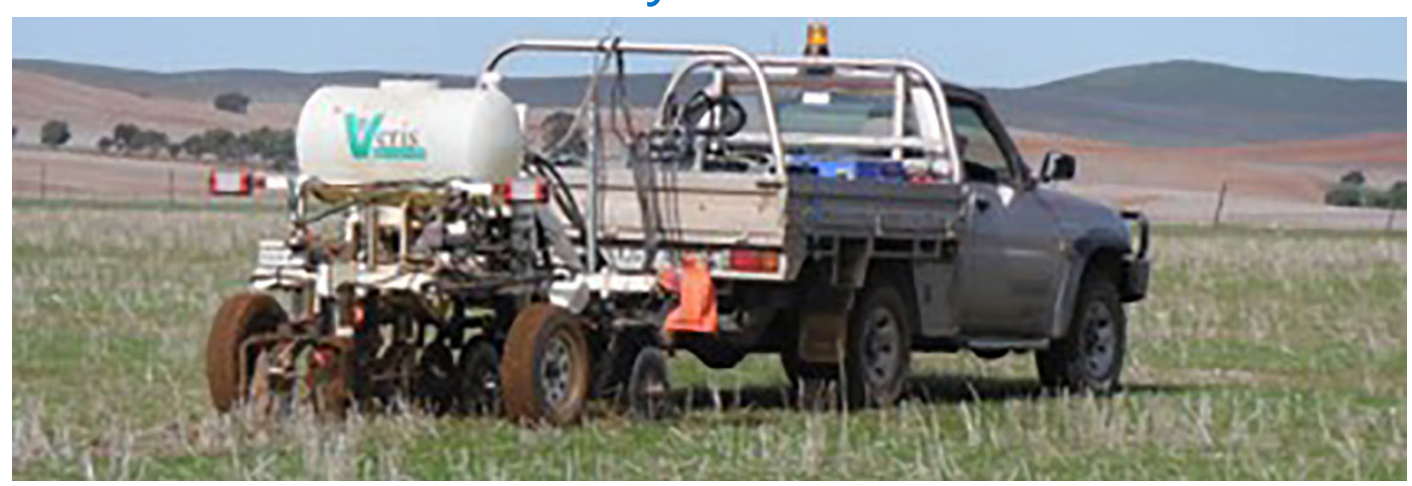
Above - Precision soil pH mapping